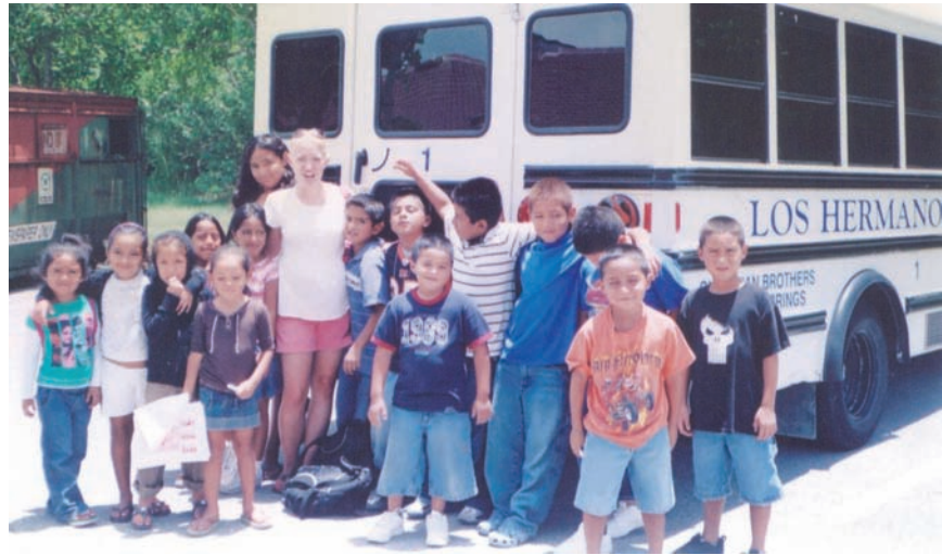
Summer campers gather next to one of the Christian Brothers buses before a field trip.

This year marks the fifth year Notre Dame students have