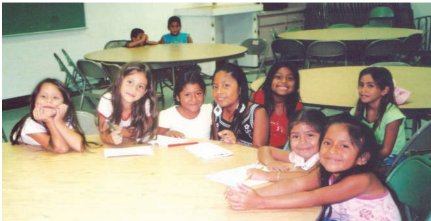
Happy campers at Summer Camp in Bonita Springs